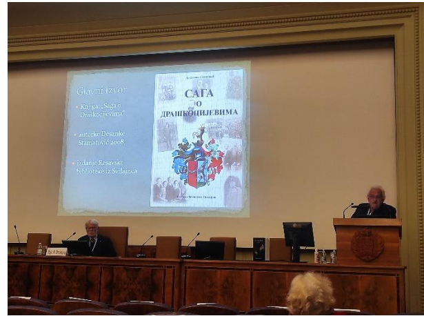
Some of the presentation during the conference