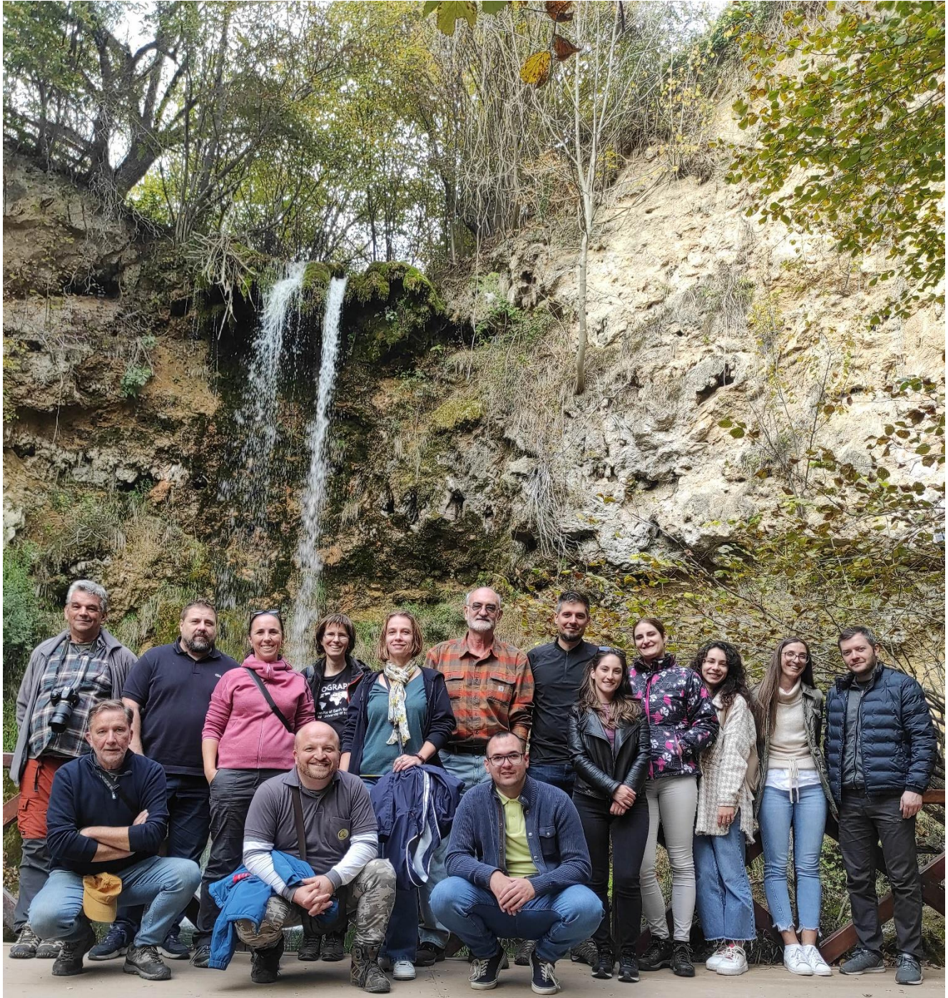
Participants of the excursion at Lisine waterfall